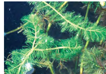
Eurasian watermilfoil.

Eurasian watermilfoil is a very aggressive exotic plant originally from Europe, Asia and Africa. It often forms dense mats of multiple stems usually 3 to 10 feet long and can grow in water up to 30 feet deep. Its leaves are made of 12-21 leaflet pairs, which form a whorl around the stem. This weed severely threatens lake environments and discourages boating, swimming, fishing, and other recreational activities. Although Eurasian watermilfoil can be spread by seed, the far more common vector is by vegetative propagules (living pieces of the plant) being carried in water currents and by commercial and recreational boat traffic and aquatic weed harvesting activities which disturb and fragment the plants and assist in the movement of those fragments throughout and among waterbodies.