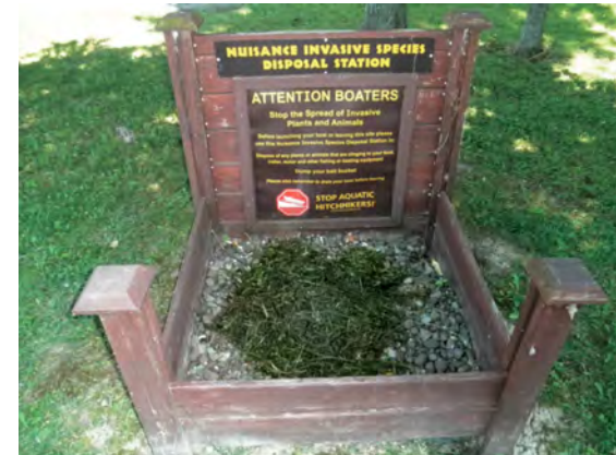
An Invasive Species Disposal Station. Boaters are encouraged to dispose of invasive species in these disposal stations.