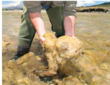
Didymo (rock snot).

Didymo, also known as "rock snot," is a freshwater algae. Historically found in cool, clear, nutrient-poor waters, didymo has expanded its worldwide distribution to include nutrient-rich waters. Rivers with stable, regulated flows are particularly at risk. During blooms, didymo can form large, yellow-brown mats that are rough to the touch. These mats can cover large sections of streambeds, altering stream conditions and choking out many of the native organisms that live on the stream bottom. Didymo can be transferred on felt bottom waders and boots and other fishing gear.