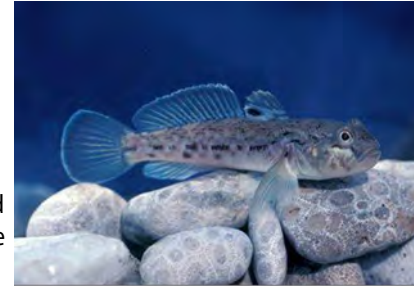
Round goby.

Round gobies are bottom-dwelling fish, from Europe, were first detected in the Saint Claire River (Great Lakes system) in 1990 and later sighted in Lake Ontario in 1996. Growing to about 10 inches with a black spot on the dorsal fin and a fused, or one, fin on the belly, gobies are aggressive, have the ability to spawn multiple times per year (every 20 days during the spawning season), and outcompete native species for food and habitat, such as sculpins and log perch. Long-term impacts from the gobies are expected to include declines in native species populations.